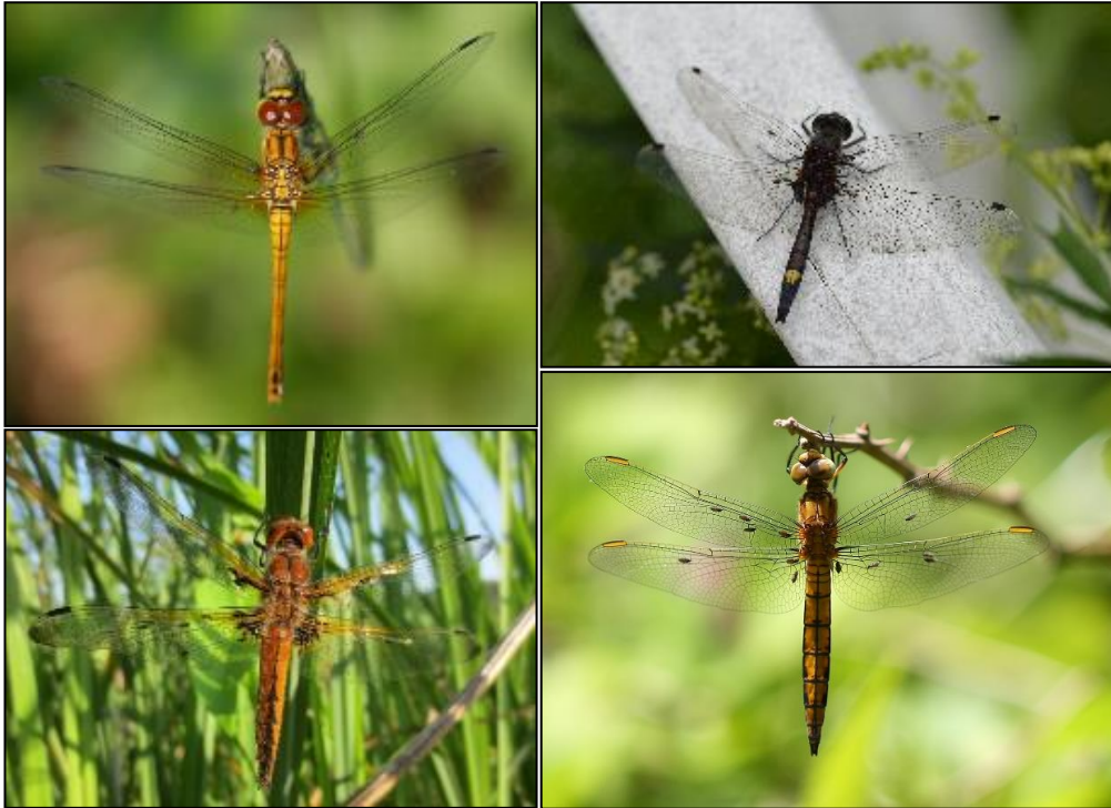
Figure 2. Three Forcipomyia paludis on Sympetrum sanguineum (L.13, Tab. 1) (top left), 15 on Leucorrhinia pectoralis (L.38, Tab. 1) (top right), 35 on Libellula fulva (L.15, Tab. 1) (bottom left) and 12 on Orthetrum coeruleescens (L.12, Tab. 1) (bottom right) (photos: D. Kulijer, M. Billqvist, D. Vinko).

Slika 2. Tri kačjepastirske mušate ( Forcipomyia paludis ) na krilih krvavordečega kamenjaka ( Sympetrum sanguineum ) (L.13, Tab. 1) (zgoraj levo), 15 na distavičnem spreletavcu ( Leucorrhinia pectoralis ) (L.38, Tab. 1) (zgoraj desno), 35 na črnem ploščcu ( Libellula fulva ) (L.15, Tab. 1) (spodaj levo) in 12 na malem modraču ( Orthetrum coeruleescens ) (L.12, Tab. 1) (spodaj desno) (foto: D. Kulijer, M. Billqvist, D. Vinko).