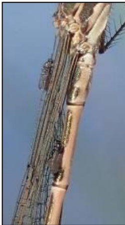
Figure 3. Two Forcipomyia paludis on Sympecma fusca on Öland Island in Sweden (L.29, Tab. 1).

Slika 2. Tri kačjepastirske mušate ( Forcipomyia paludis ) na krilih krvavordečega kamenjaka ( Sympetrum sanguineum ) (L.13, Tab. 1) (zgoraj levo), 15 na distavičnem spreletavcu ( Leucorrhinia pectoralis ) (L.38, Tab. 1) (zgoraj desno), 35 na črnem ploščcu ( Libellula fulva ) (L.15, Tab. 1) (spodaj levo) in 12 na malem modraču ( Orthetrum coeruleescens ) (L.12, Tab. 1) (spodaj desno).