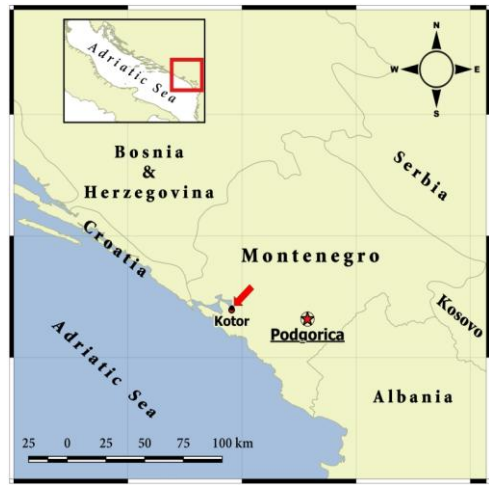
Figure 2. Map with marked locality (red circle) where the two-headed Elaphe quatuorlineata was found.

Slika 1. Elaphe quatuorlineata z dvema glavama, najden 29.10.2014 v Dobroti, Kotor.