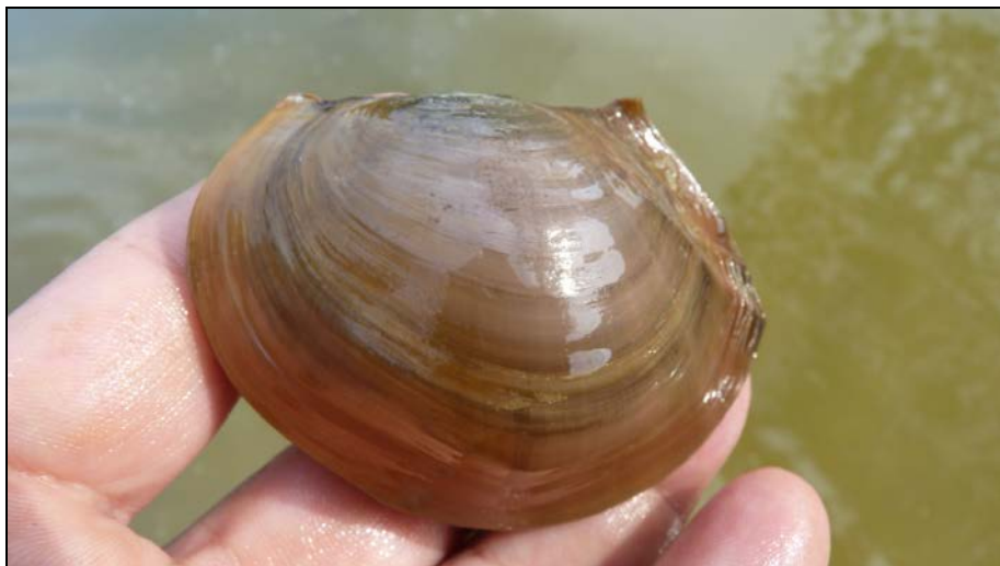
Figure 1. The found specimen of Sinanodonta woodiana Slika 1. Najdeni primerek vrste Sinanodonta woodiana