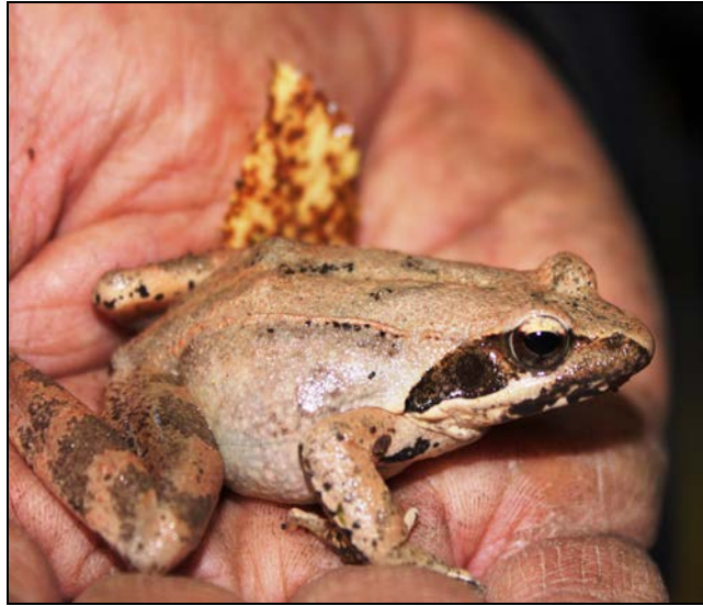
Figure 2. Italian agile frog ( Rana lataste ), lateral view. Slika 2. Laška žaba ( Rana lataste ), pogled na bočno stran.