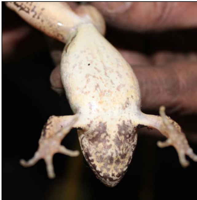
Figure 3. Italian agile frog ( Rana lataste ), ventral view. Slika 3. Laška žaba ( Rana lataste ), pogled na ventralno stran.