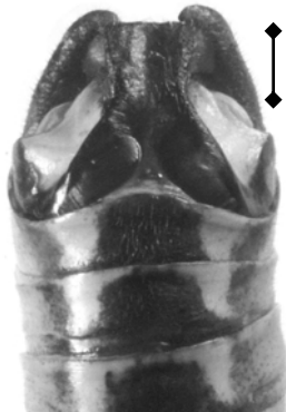
Figure 2: Epiproct and cerci of the male Andreiniimon nuptialis – dorsal view (scale: 1 mm).

near Trieste (alt. 30m, UTM VL 05). This locality is only briefly mentioned beside the photograph of Andreiniimon nuptialis in the monograph on the orthopteroid insects of the Veneto Region (Fontana et al. 2002), but is not included in the paper on the Orthoptera of the Adriatic coast of Italy (Fontana & Kleukers 2002). It should be pointed out that the mentioned Italian and Slovenian localities are only 14 kilometres apart. Together with an outline of the known distribution range of Andreiniimon nuptialis in Europe, these two isolated localities on the northern border of the species range are presented in Fig. 4.