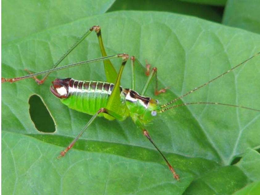
Figure 1: Male Andreiniimon nuptialis (17-VIII-2005; Podgrad pri Vremah, SW Slovenia; Photo: M. Bedjanič – colour photograph available on http://www.bf.uni-lj.si/bi/NATURA-SLOVENIAE ; body length: 18 mm) Slika 1: Samec vrste Andreiniimon nuptialis (17-VIII-2005; Podgrad pri Vremah, SZ Slovenia; Foto: M. Bedjanič – barvna fotografija dosegljiva na http://www.bf.uni-lj.si/bi/NATURA-SLOVENIAE ; dolžina telesa: 18 mm)

unique that the determination of the genus and species level was straightforward. Andreiniimon nuptialis (Karny, 1918) - a putative endemic species originally known from the southern Balkans and central Italy - was found in Slovenia for the first time. Both collected specimens have been included in the author's private collection.