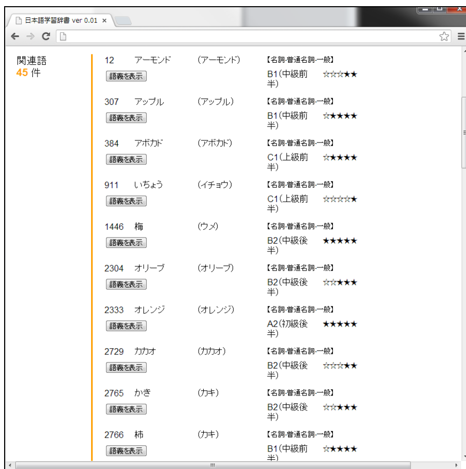
Figure 4: Words related to ringo (“apple”)

Words listed as “related words” under the headword ringo (りんご “apple”) in this figure include other words for fruits and plants, such as aamondo (アーモンド “almond”), appuru (アップル “apple”), abokado (アボカド “avocado”), ichou (いちよう “ginkgo”), ume (梅 “Japanese apricot”), etc. The system is based on the Bunrui goiyou (“Table of vocabulary by semantic categories”) mentioned above. The word ringo , for example, is categorised in Bunrui goiyou as “noun > nature > flora > trees”, and all words pertaining to the same category are extracted by the system and displayed as related words.