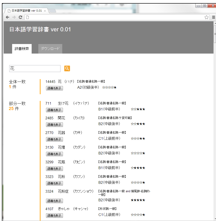
Figure 2: Prototype of a dictionary search system

The system development group has developed a prototype system to search the database online and download data, as shown in Figure 2.