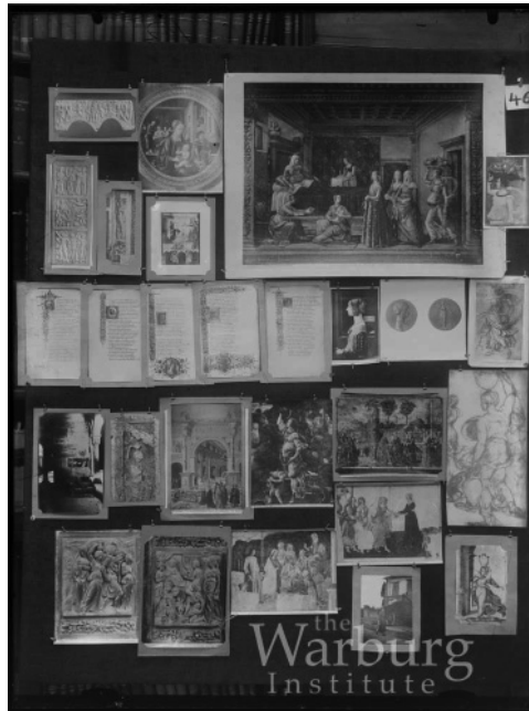
Figure 1: Aby Warburg, The Mnemosyne Atlas , Panel 46, 1929, The Warburg Institute, London, UK 4 .

London University. In 1924, after undergoing the treatments for psychological illness in Swiss clinics, Warburg begun creating Mnemosyne Atlas . He died in 1924, leaving this large and complexly envisioned project uncompleted.