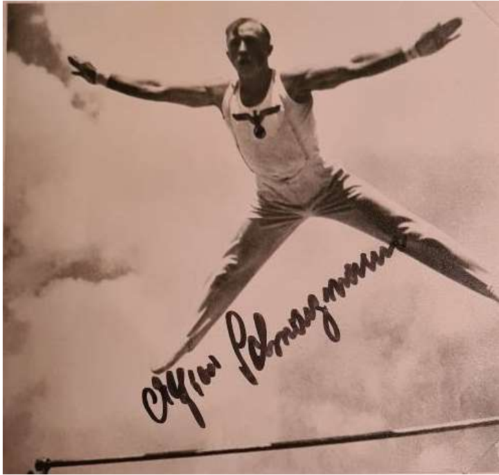
Dismount at OG 1936