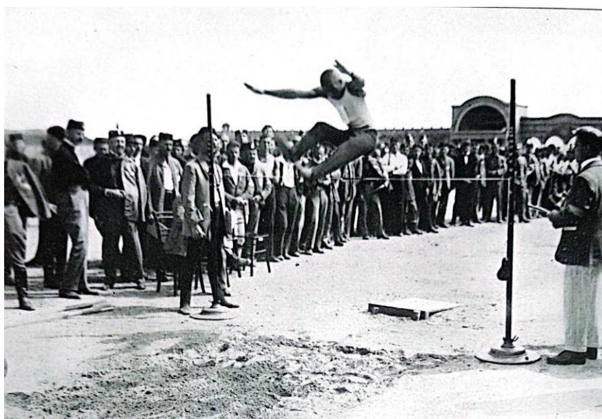
High jump technique at the 1922 World Championships

(in 1920 at OG Olympic champion Charley Paddock, USA won with 10.8 s)